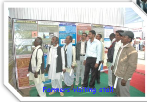
Farmers visiting stall